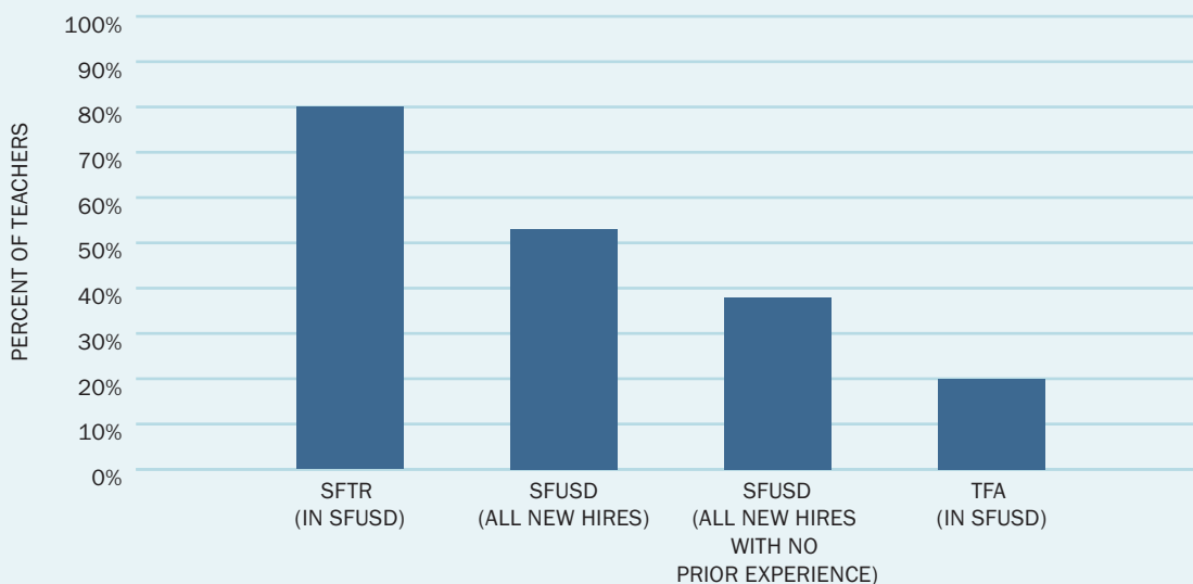
Figure 1 Comparison of 5-Year Teacher Retention Rates: SFUSD