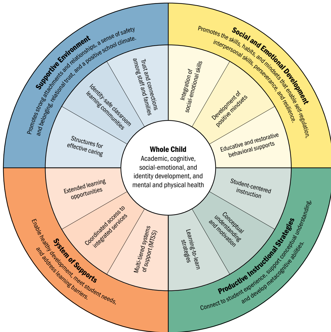
Figure 1 A Framework for Whole Child Education

Source: Darling-Hammond, L., & Cook-Harvey, C. M. (2018). Educating the whole child: Improving school climate to support student success . Learning Policy Institute.