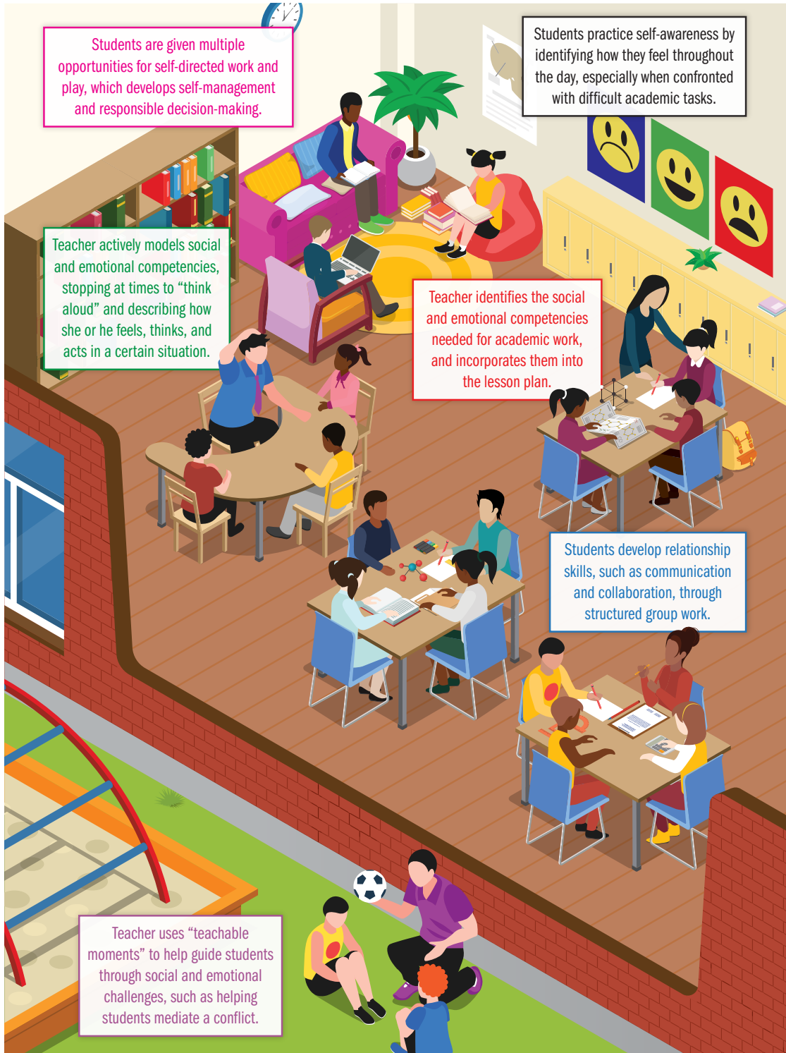
Figure 4.2 Ways That Social and Emotional Learning Can Be Integrated Throughout the School Day